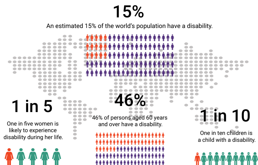
Figure 1 Global population of persons with disabilities (IASC Guidelines, 2019, Inclusion of Persons with Disabilities in Humanitarian Action)